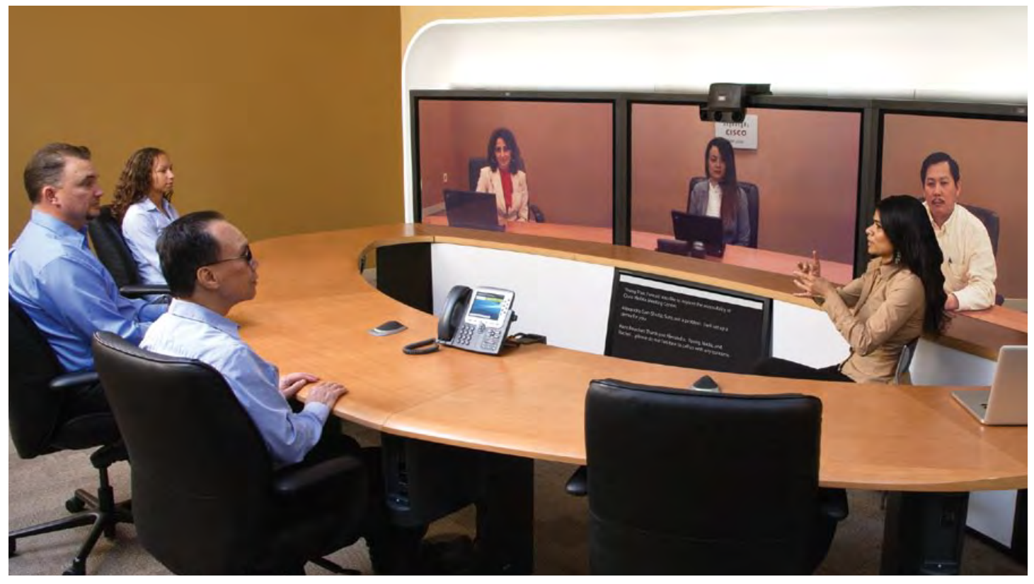
The Cisco TelePresence® portfolio creates an immersive, face-to-face experience over the network.